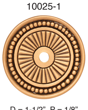
D = 1-1/2" P = 1/8"